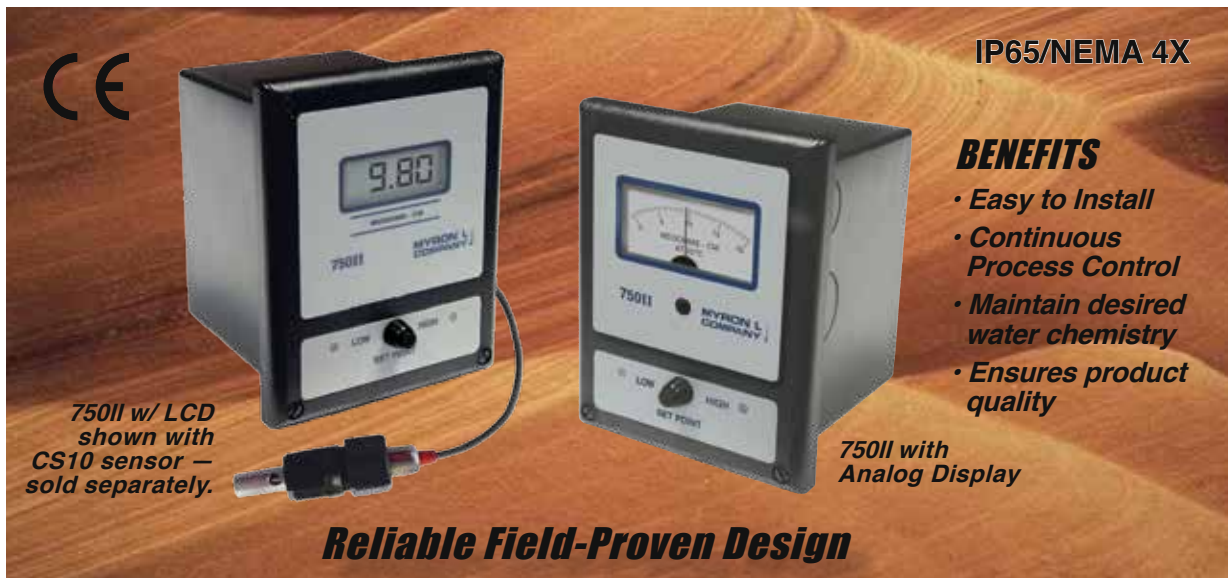
750II w/ LCD shown with CS10 sensor — sold separately.