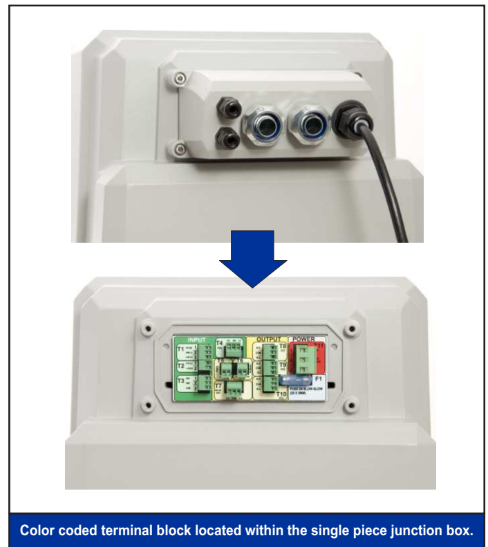
Color coded terminal block located within the single piece junction box.