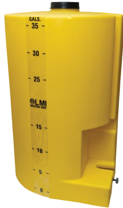
Model No. 27400 Tank Assembly (Pump must be ordered separately.)